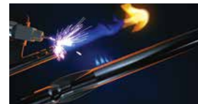
Instant JETFIRE™ ignition