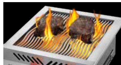
Can be used as a side burner