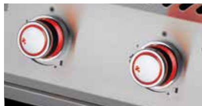
NIGHT LIGHT™ control knobs with SafetyGlow