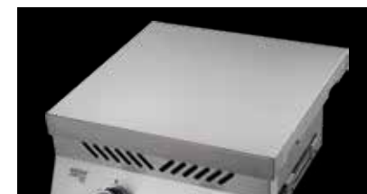
Stainless steel cover