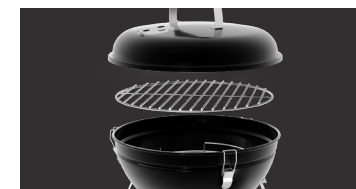
Easy to assemble design