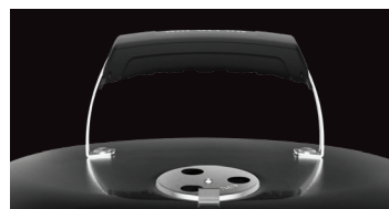
Cool touch handle