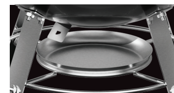
Steel plated drip pan