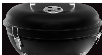
Porcelain-enameled lid and bowl