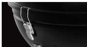
Locking latches and easy carry handle