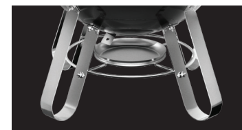
Sturdy four legged design