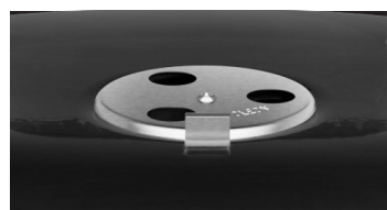
Adjustable air vents provide optimal air control