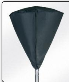
Heavy-duty nylon cover protects burner assembly when stored outside