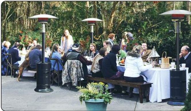
Ideal for large or small gatherings

Commercial Grade Design For Performance & Reliability!